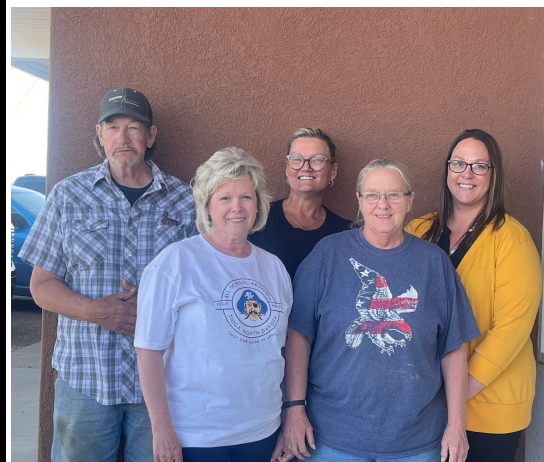
Freedom Fest Committee Members

A complete event schedule with times and places and class picture schedule will be available and posted on the facebook page along with posters in several locations. If you plan on attending the reunion, please get your registrations in asap.