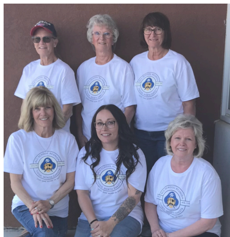
Tioga 2024 All School Reunion Committee